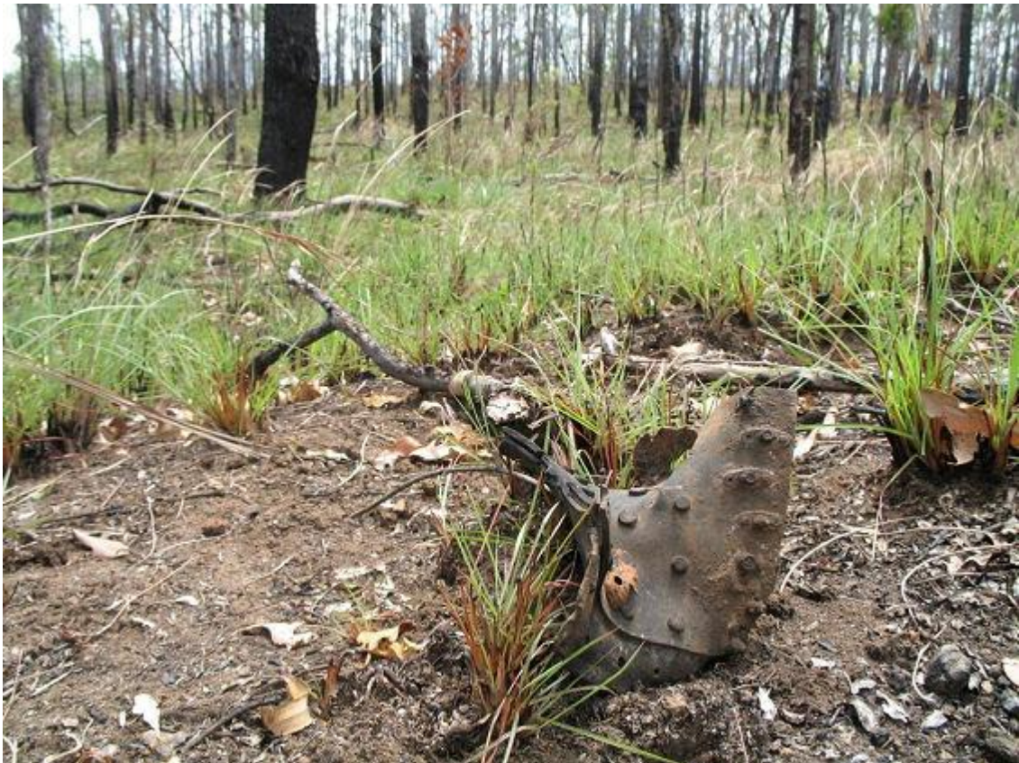
CRASH SITE OF "HEAVENLY BODY"